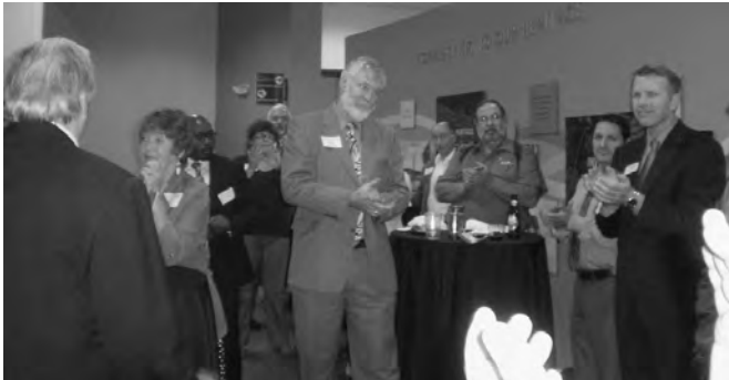
Our “Networking at the Heart of Merrimack Valley” Business Networking Mixer was hosted and sponsored by the Merrimack Valley Federal Credit Union.