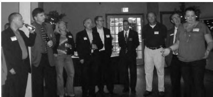
“Member Appreciation” Business Networking Mixer was hosted by Amesbury Sports Park and sponsored by The Olbricht Storniolo Group

All Business Networking Mixers featured delicious appetizers, and beverages, exciting door prizes and, a great opportunity for business networking. Many thanks to our hosts, sponsors and prize donors!