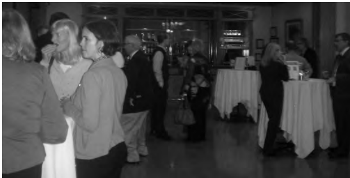
“Member Appreciation” After Expo Business Networking Mixer was hosted by Andover Country Club and sponsored by Salem Radiology LLP.