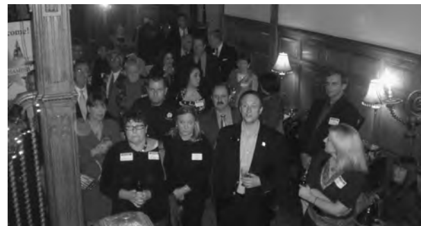
“Ring in the Holidays” Business Networking Mixer hosted by Stevens Estate at