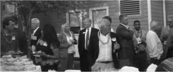
“Cookout on the Patio” Business Networking Mixer was hosted by Residence Inn by Marriott, Tewksbury and co-sponsored by Metro Credit Union.