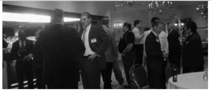
“Member Appreciation” Business Networking Mixer was hosted DiBurros of Ward Hill and sponsored by Georgetown Bank.